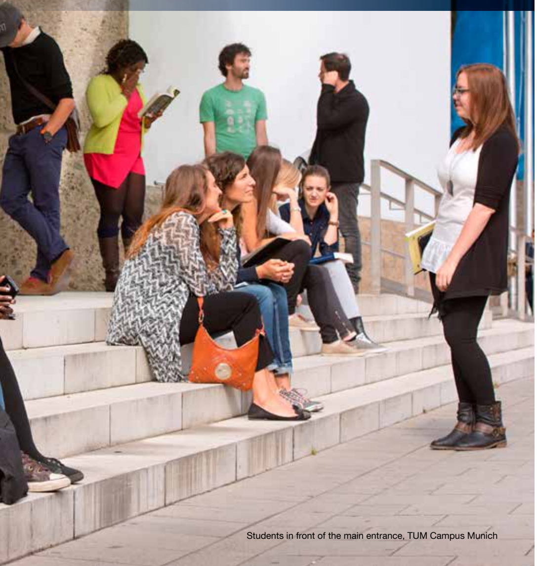
Students in front of the main entrance, TUM Campus Munich